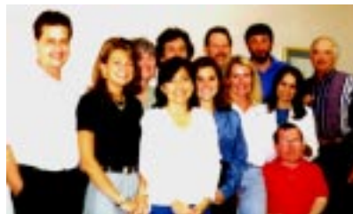
A warm welcome to our 1999-Y2K Board of Directors