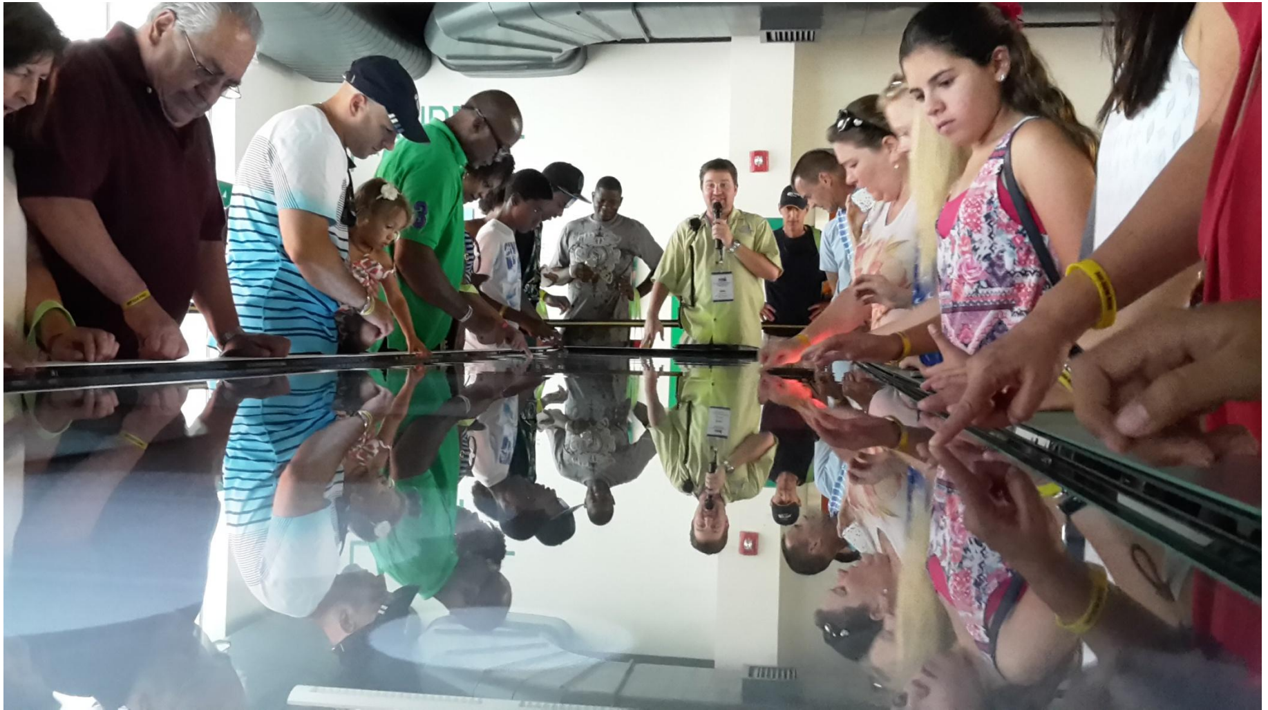
Visitors learn at the interactive touch table in the new Education Center