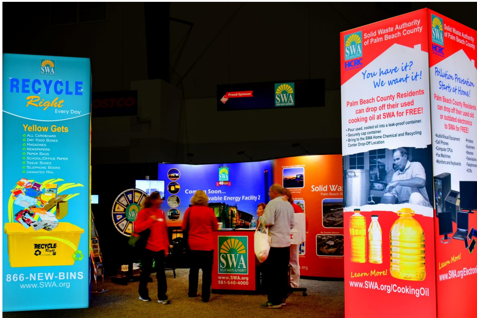
Solid Waste Authority volunteers engage visitors at the South Florida Fair