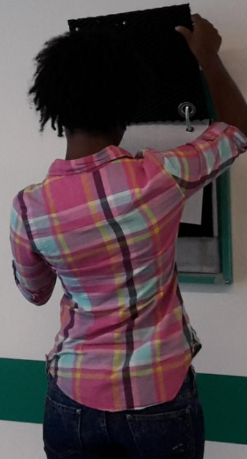
A student interacts with the wall display at the new Education Center