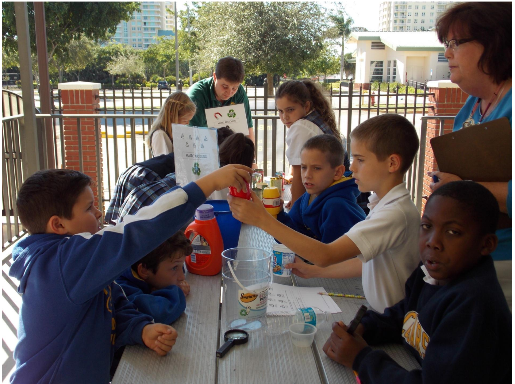
Students learn about recycling and waste reduction at their school