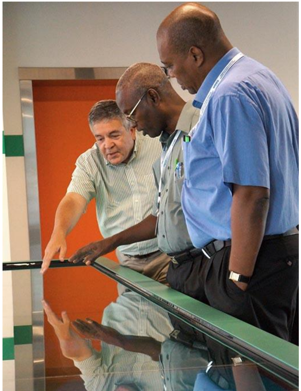
Visitors learn at the interactive touch table in the new Education Center