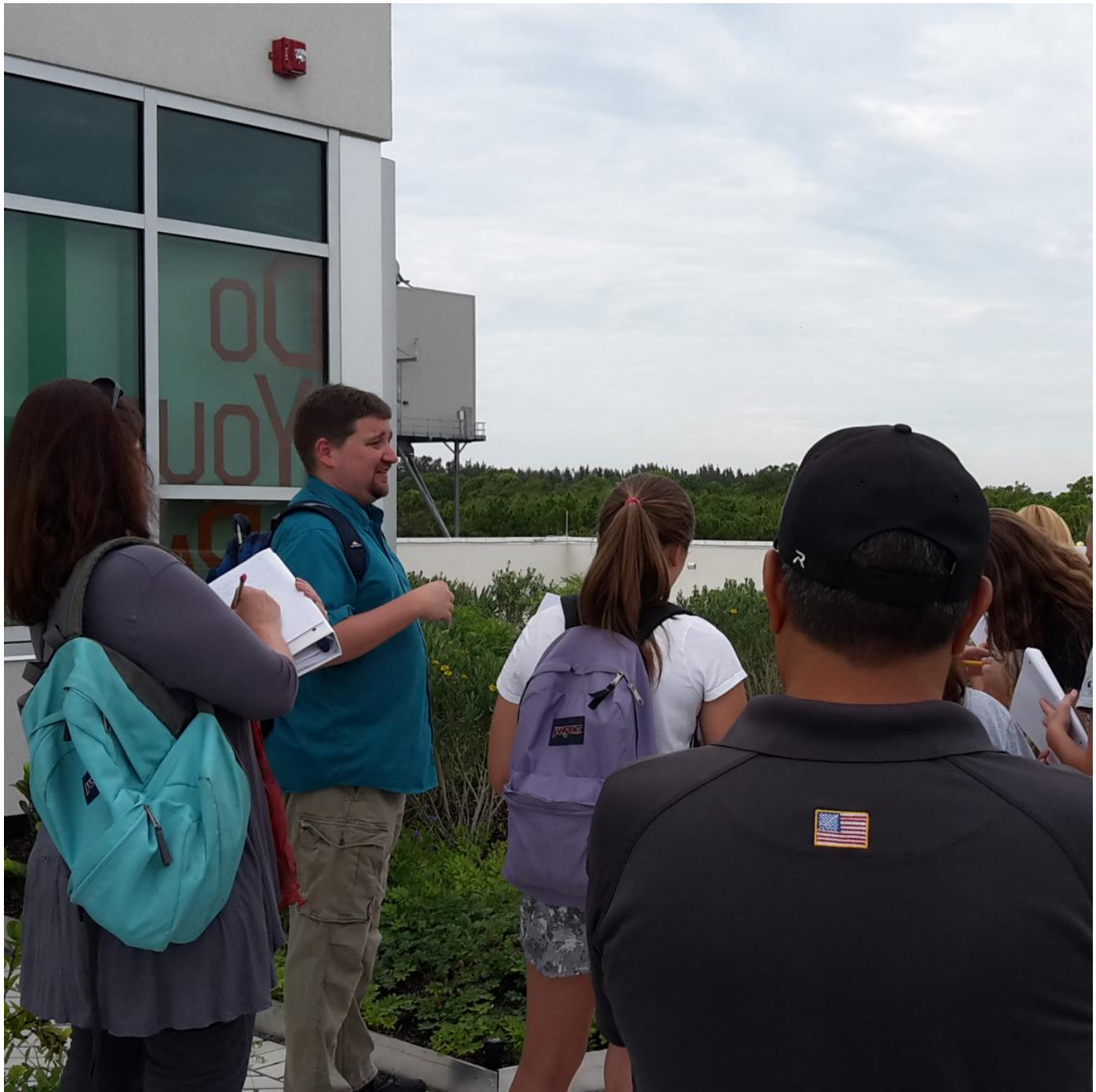
Students explore the vegetated roof on the new Education Center